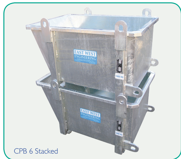
CPB 6 Stacked