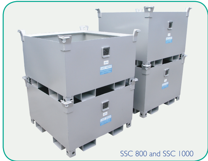
SSC 800 and SSC 1000