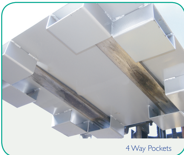
4 Way Pockets