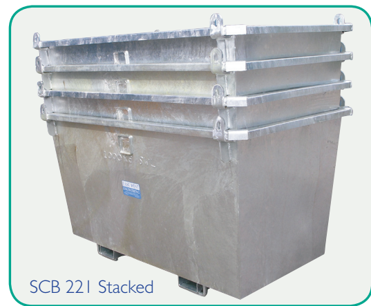
SCB 221 Stacked