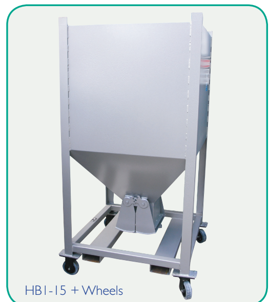
HBI-15 + Wheels