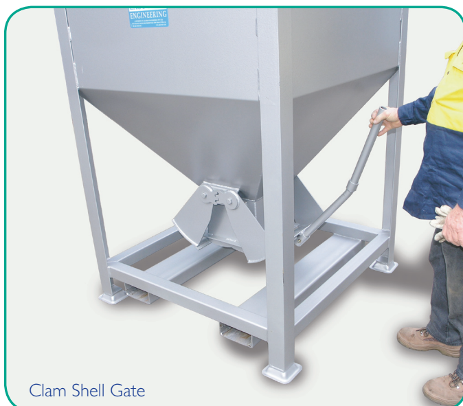
Clam Shell Gate