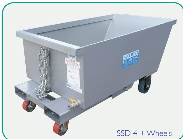
SSD 4 + Wheels