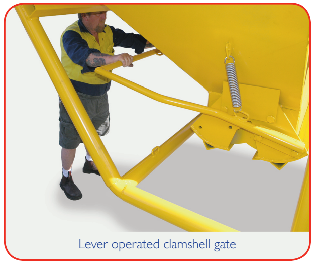
Lever operated clamshell gate