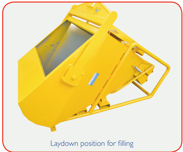
Laydown position for filling