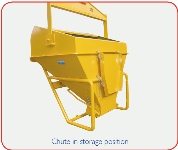
Chute in storage position