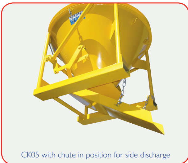
CK05 with chute in position for side discharge