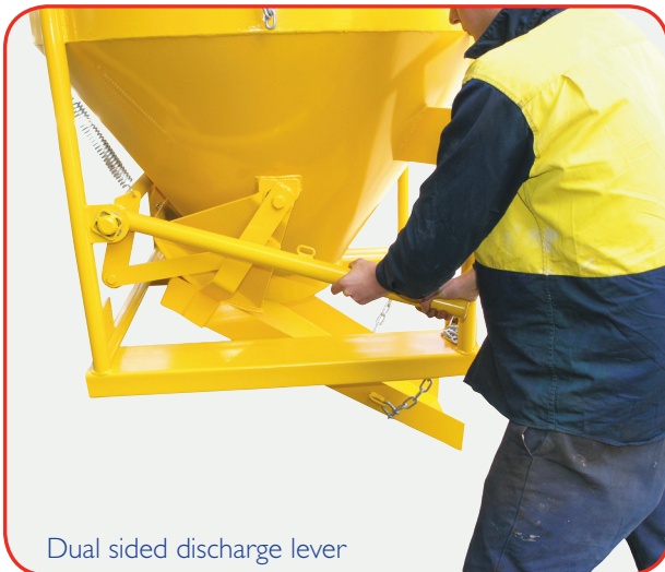
Dual sided discharge lever