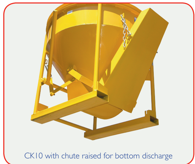
CK10 with chute raised for bottom discharge