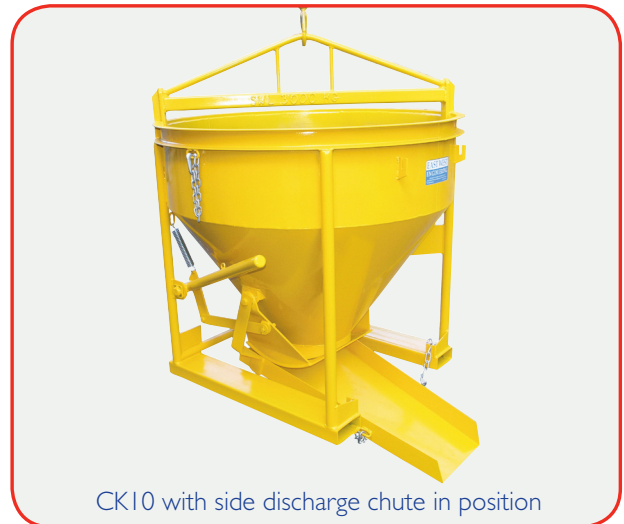
CK10 with side discharge chute in position